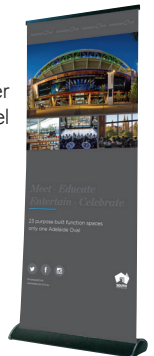
Pull Up Banner Classic Model

Please refer to our website aeh.com.au or our product catalogue. Place your order on the form provided there.